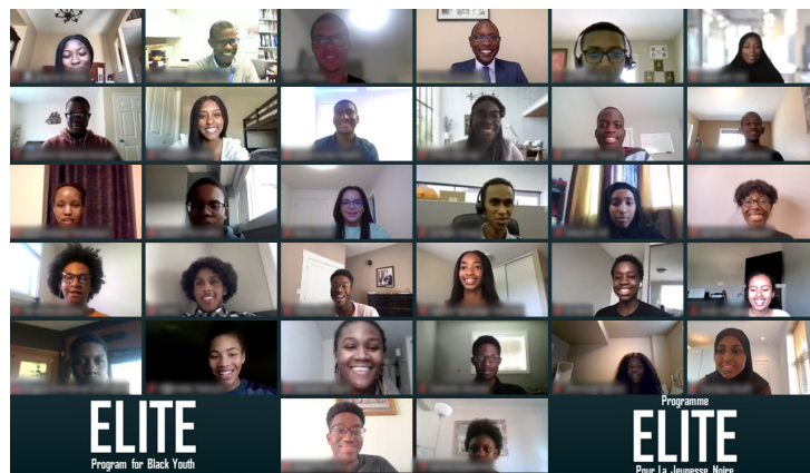
ELITE Program interns delivering technical presentations on 26 August 2021

"It's really cool to be in this environment where you're surrounded by other Black associates who are also working towards their own success. It's definitely something I haven't had before: supervisors who understand the specific nuances of the Black experience in a professional sense."